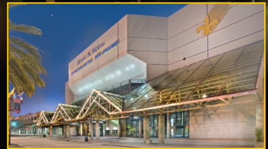
Ernest N. Morial Convention Center New Orleans, Louisiana